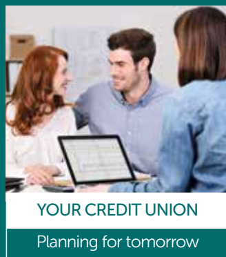
YOUR CREDIT UNION Planning for tomorrow

You can qualify for Newington's Match Savings Scheme if you do not currently have a credit union account or if your credit union account has been inactive for more than 2 years.