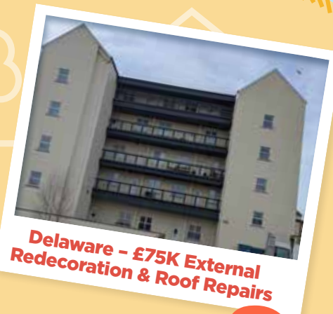
Delaware - £75K External Redecoration & Roof Repairs