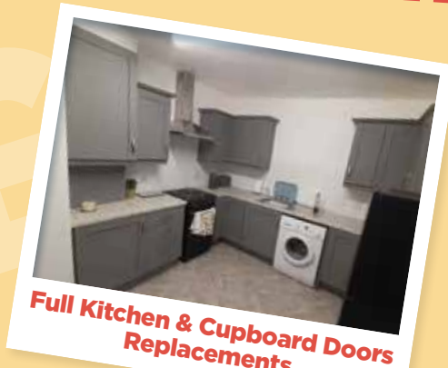
Full Kitchen & Cupboard Doors Replacements